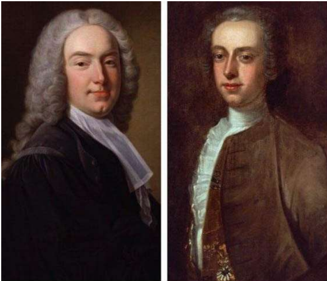
Colonial Governor Thomas Hutchinson, left, named the town of Mansfield in honor of William Murray, right, the First Earl of Mansfield, England, who was Chief Justice of the King's Bench.

Norton's Town Meeting was not willing to relinquish its northern area. But after a few failed attempts, the Norton North Precinct was approved in 1731. Many in Norton refused to recognize the vote. They