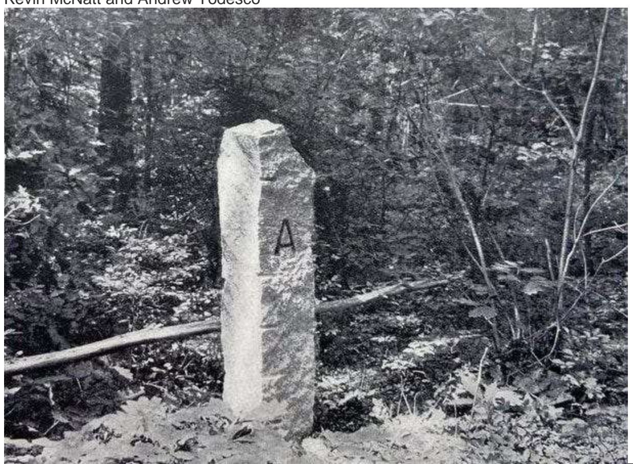
In 1960, Mansfield and Sharon officials hiked into the woods off Mansfield Avenue and Bird Road to locate one of the granite shafts marking the town boundaries.