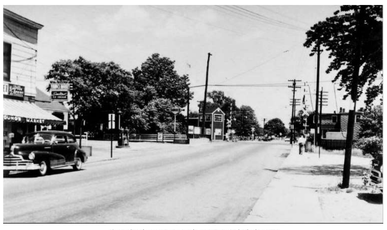
Above, the Chauncy Street grade crossing as it looked in 1950.

When the main railroad line first cut through Mansfield in 1835, grade crossings were not so troublesome. The town had a population of about 1,500. The villages of East and West Mansfield were as populated as the center of town. The main line only crossed a roadway at Central and West streets, and Elm and Gilbert streets in West Mansfield. When the Taunton (Old Colony) branch was added in 1836, it intersected with North Main, East and Fruit streets.